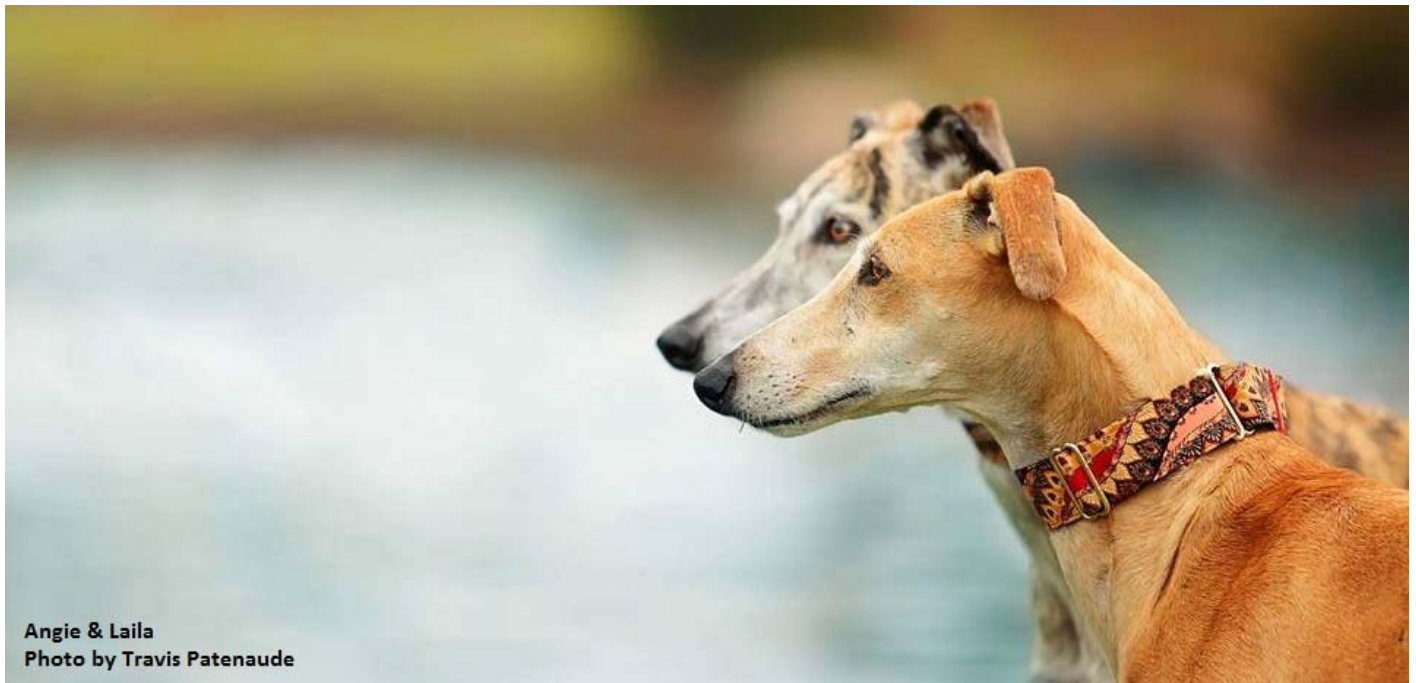
Angie & Laila